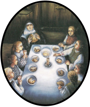
The First Supper